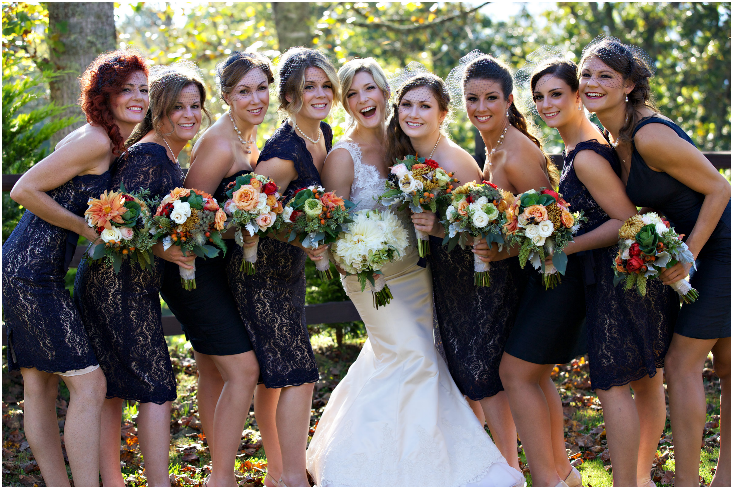
Just laugh at my jokes and we'll get along famously!