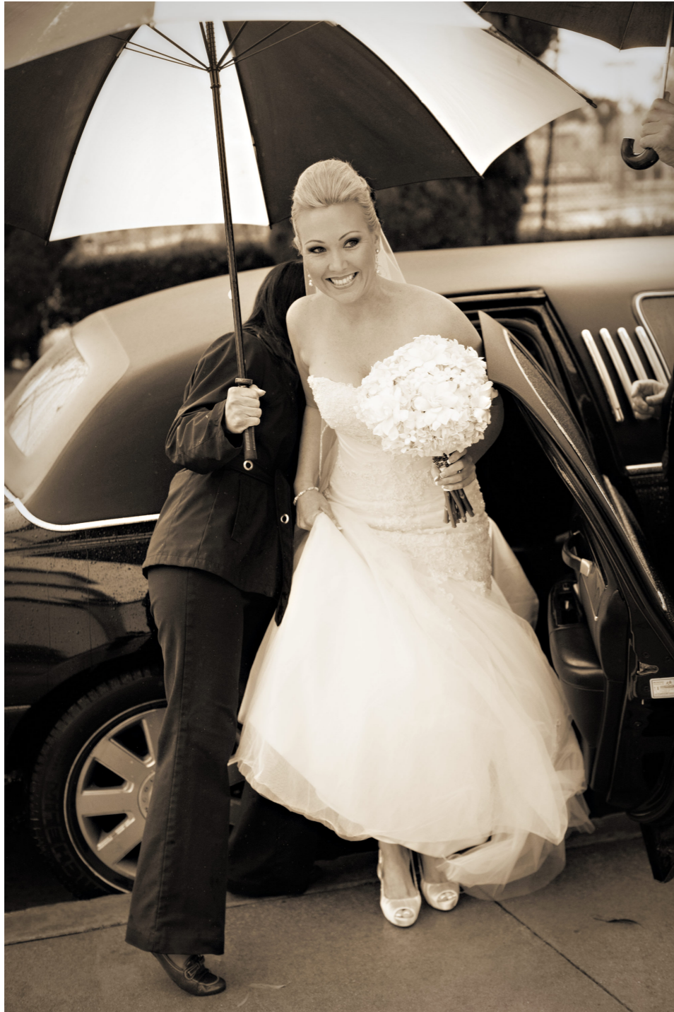
Rain or shine, I am always looking to capture the joy and excitement of your wedding.