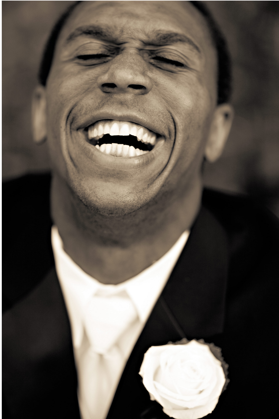
I love blowing the background out of focus ensuring that my subjects stand out in their portraits.