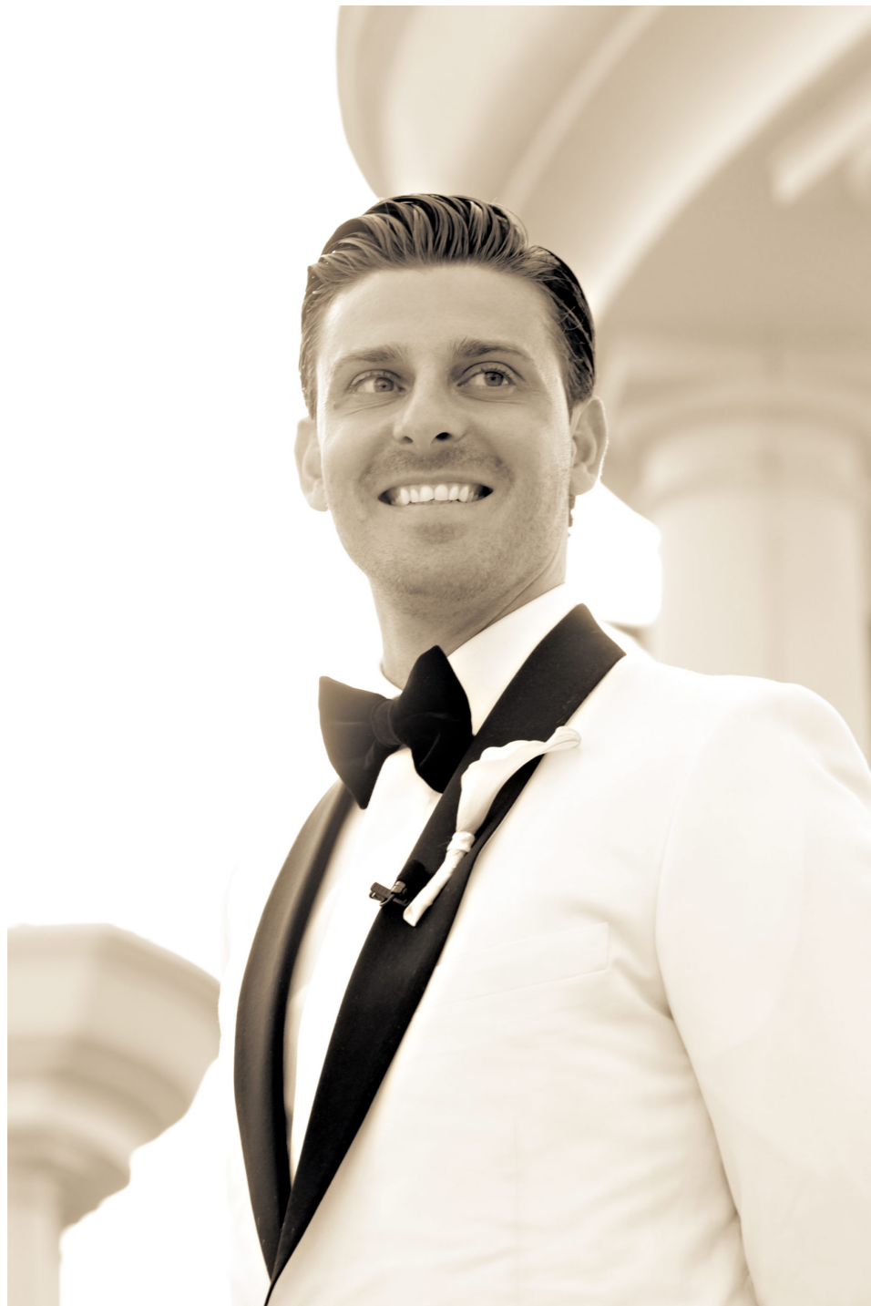
Of course getting the grooms reaction as the bride walks down the aisle is a top priority.