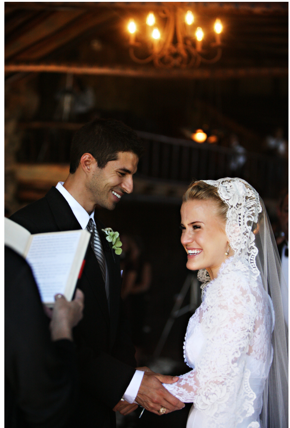
I've got a wide angle lens to show the entire space & a zoom to get in close without being in your way.