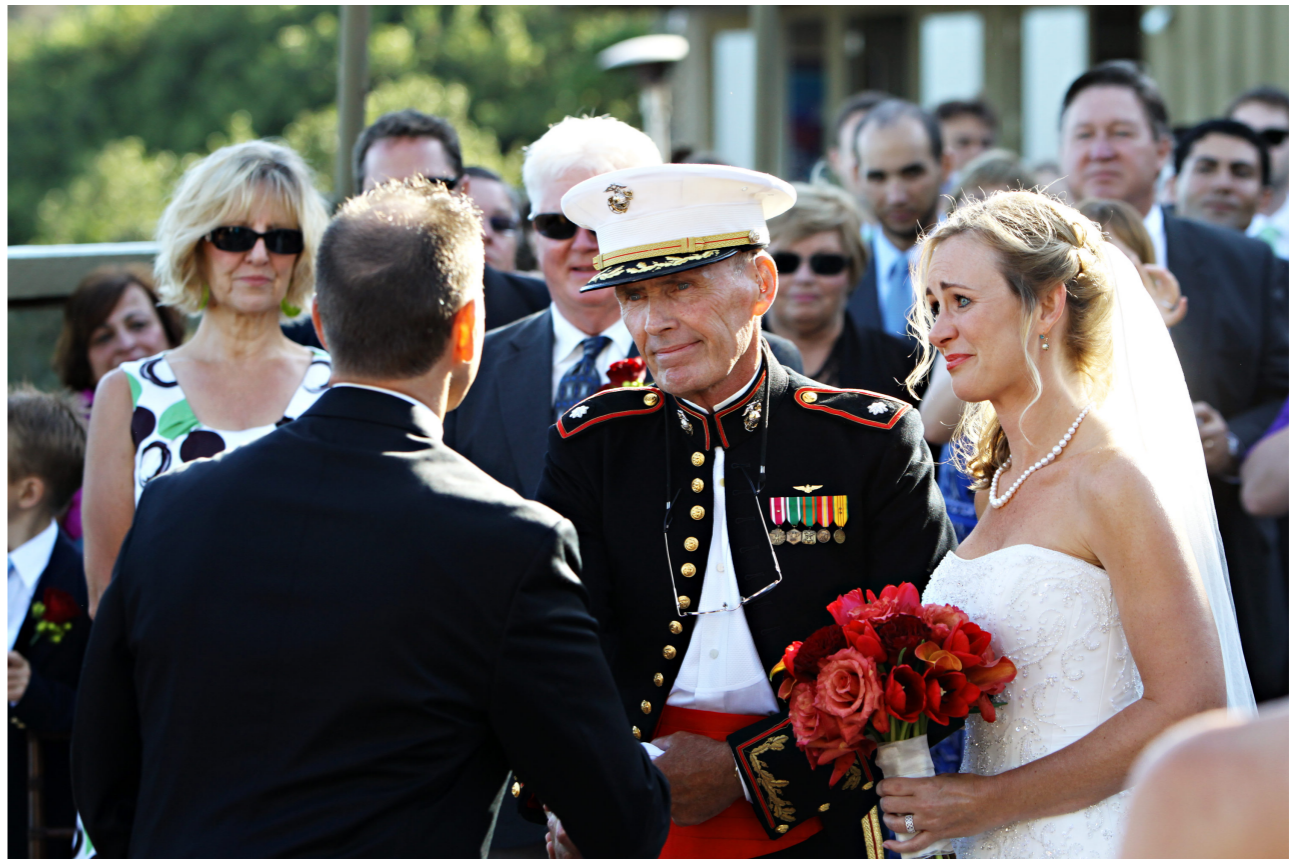
There's a special bond between dad's & daughters and I love capturing these real moments right before the ceremony.