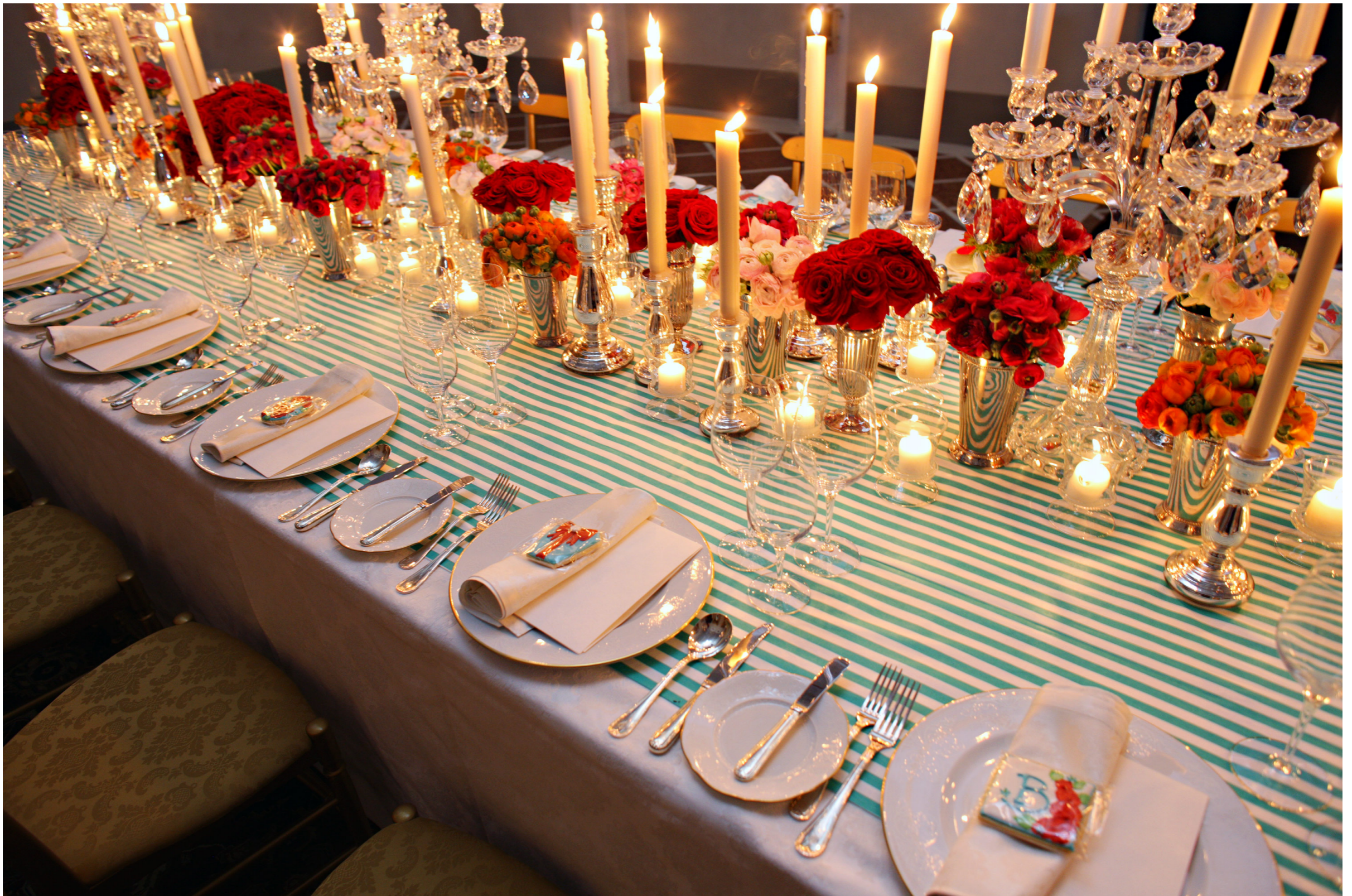
I love this intimate table setting for a small destination wedding at the Four Seasons in Florence, Italy.