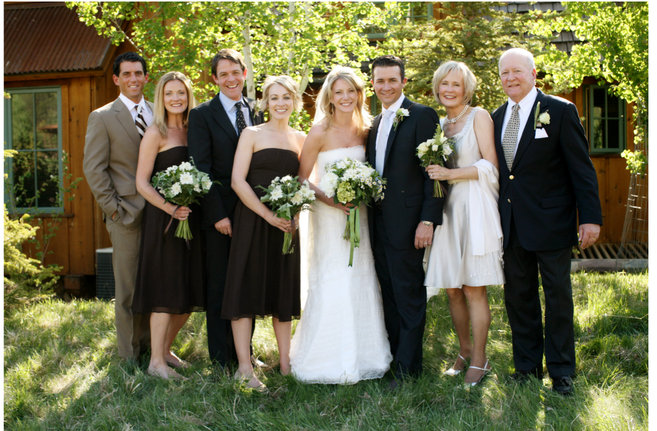
Of course we'll take time to keep mom & dad happy and get those important family photos, but I'll still capture them with my relaxed style.