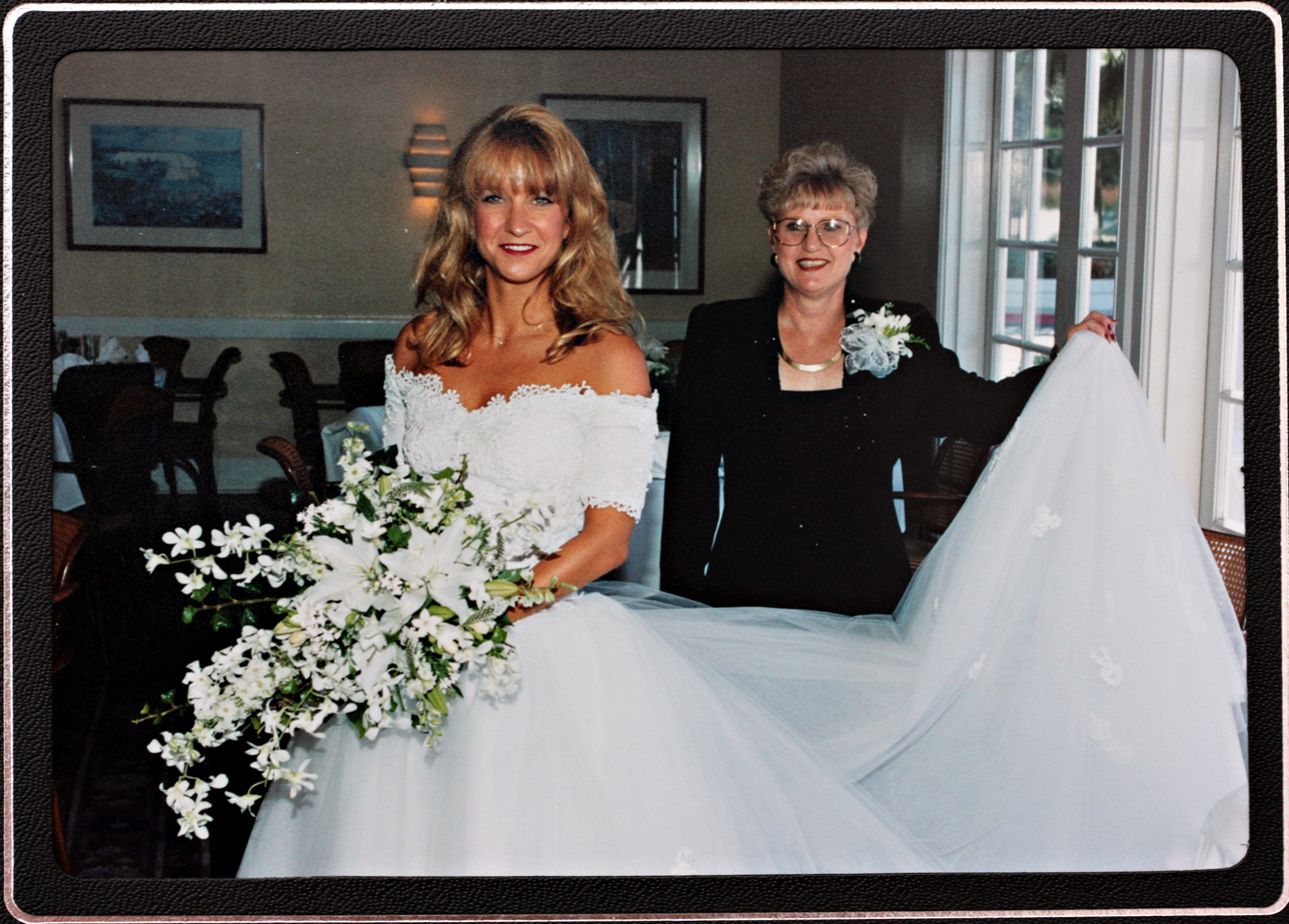
You shouldn't have to settle with average, boring photography. (I shot this gem in '94, well before I actually became a wedding photographer.)