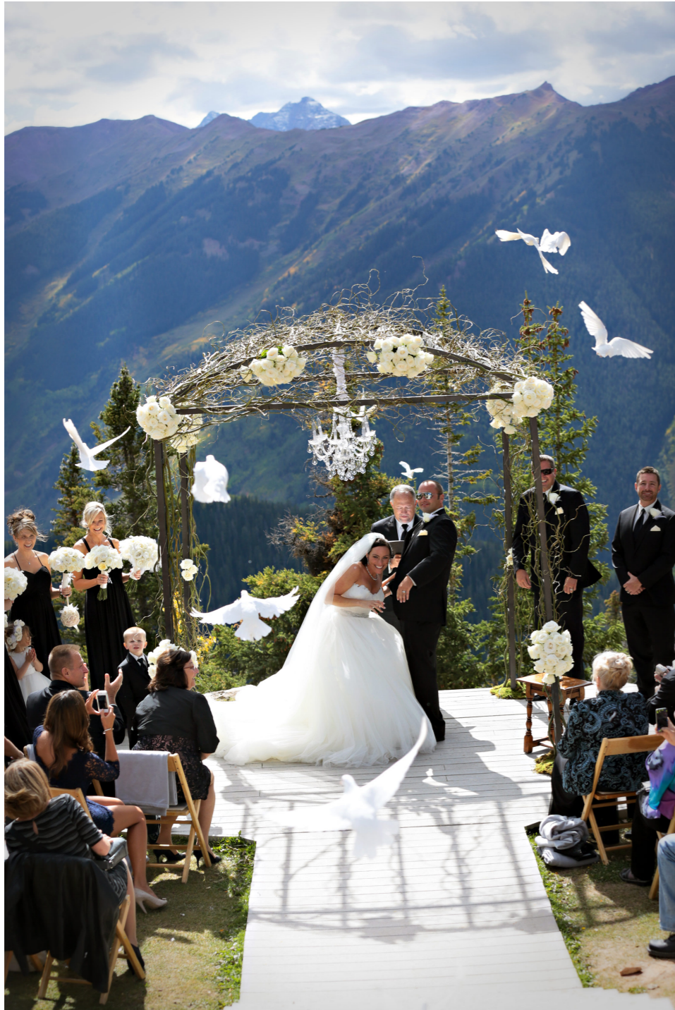
Whether you are getting married on a mountain top, or The Vatican, I aim to be a fly on the wall.