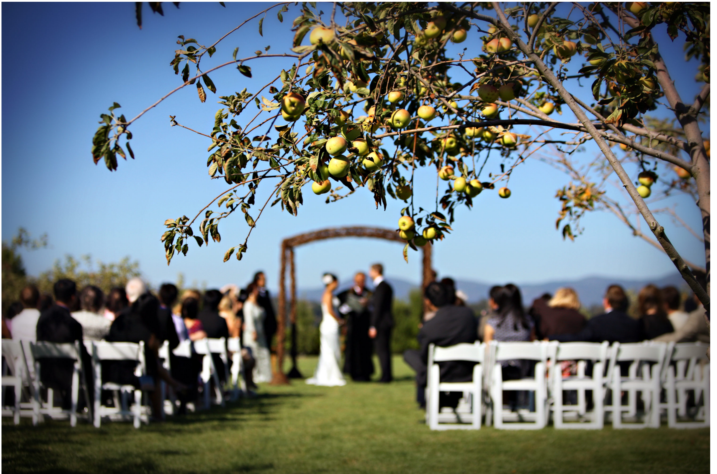
Todd & Diana celebrated their nuptials in an apple orchard near Napa Valley.