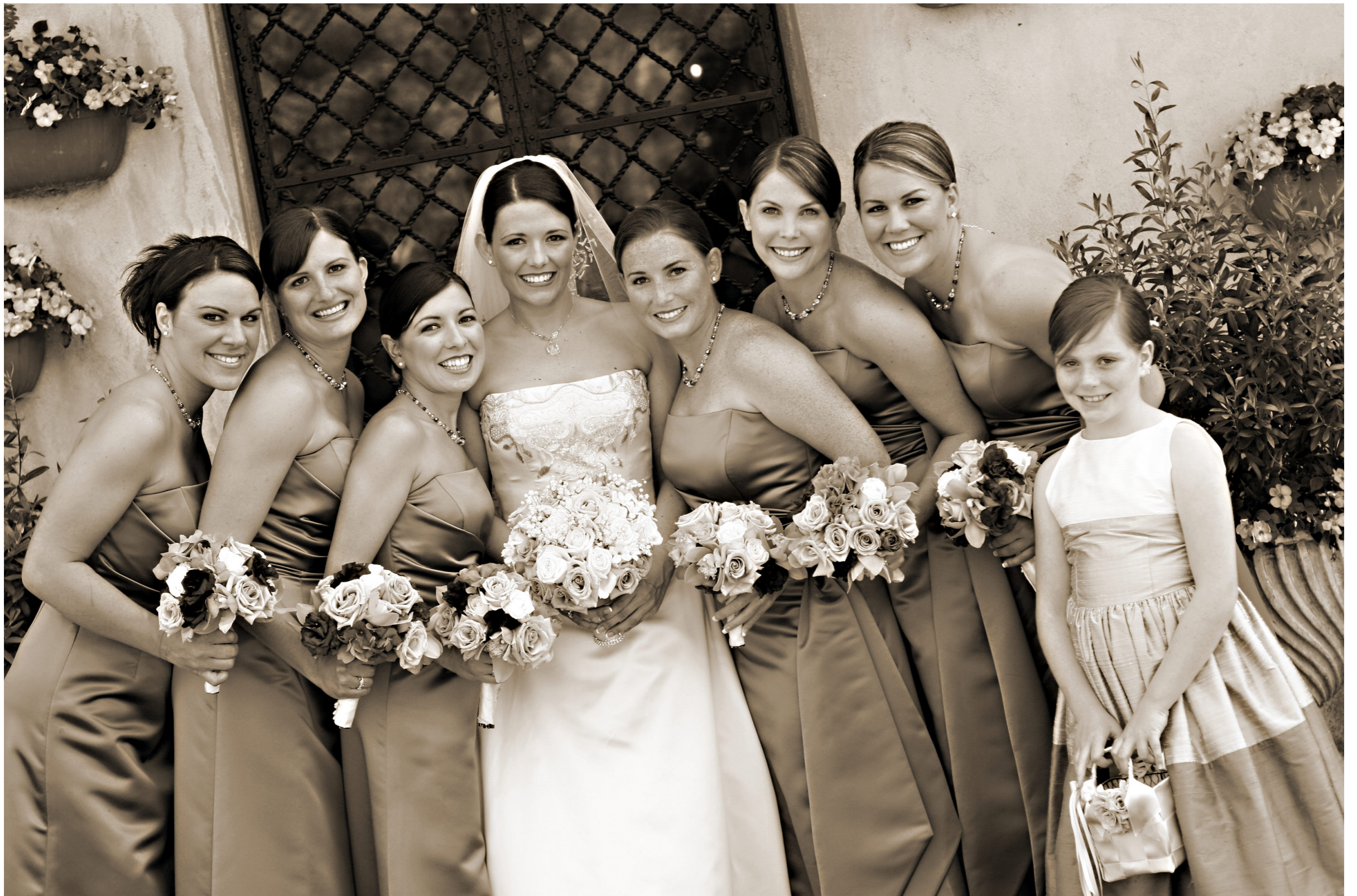
I promise to put you in nice, flattering light and won't make you stand in any stiff, uncomfortable poses.